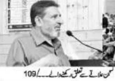
09 جولائی // سجن سے تعلق رکھنے والے متعدد سیاسی و سماجی لیڈران اور کارکنان اپنی پارٹی میں شامل ہوئے۔

09 جولائی // سجن سے تعلق رکھنے والے متعدد سیاسی و سماجی لیڈران اور کارکنان اپنی پارٹی میں شامل ہوئے۔ انہوں نے کہا کہ حکومت عوامی مسائل کو سنجیدگی سے لے کرے گی۔ 09 جولائی // سجن سے تعلق رکھنے والے متعدد سیاسی و سماجی لیڈران اور کارکنان اپنی پارٹی میں شامل ہوئے۔ انہوں نے کہا کہ حکومت عوامی مسائل کو سنجیدگی سے لے کرے گی۔