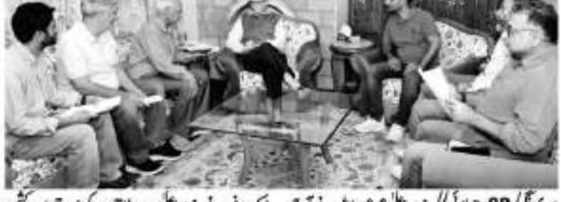
09 جولائی // وزیر اعلیٰ عمر عبداللہ نے آج مختلف عوامی وفدوں سے ملاقات کی اور ان کے مسائل کے حل کے لیے ہدایت کی۔

09 جولائی // وزیر اعلیٰ عمر عبداللہ نے آج مختلف عوامی وفدوں سے ملاقات کی اور ان کے مسائل کے حل کے لیے ہدایت کی۔ انہوں نے کہا کہ حکومت عوامی مسائل کو سنجیدگی سے لے کرے گی۔ 09 جولائی // وزیر اعلیٰ عمر عبداللہ نے آج مختلف عوامی وفدوں سے ملاقات کی اور ان کے مسائل کے حل کے لیے ہدایت کی۔ انہوں نے کہا کہ حکومت عوامی مسائل کو سنجیدگی سے لے کرے گی۔