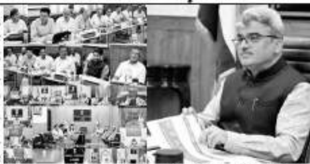
09 جولائی // چیف سیکرٹری اٹل ڈولو نے جامع جائزہ میٹنگ کی صدارت میں پی ایم سورہ گھری کی شرکت کی۔

جموں و کشمیر پی ایم سورہ گھری نے 09 جولائی کو چیف سیکرٹری اٹل ڈولو کی صدارت میں جامع جائزہ میٹنگ منعقد کی۔ میٹنگ میں پی ایم سورہ گھری نے جموں و کشمیر میں سولر انڈیشن مشن کیلئے ماہانہ اہداف طے کئے۔ چیف سیکرٹری نے سولر انڈیشن مشن کیلئے ماہانہ اہداف طے کرنے کی ضرورت پر زور دیا۔ انہوں نے مختلف ایجنسیوں کو ہدایت دی کہ تقریباً 57 ہزار ایسے مستفیدین کے گھروں پر پروف ٹاپ سولر کلام جلد از جلد نصب کیا جائے۔ میٹنگ میں چیف سیکرٹری نے سولر انڈیشن مشن کیلئے ماہانہ اہداف طے کرنے کی ضرورت پر زور دیا۔ انہوں نے مختلف ایجنسیوں کو ہدایت دی کہ تقریباً 57 ہزار ایسے مستفیدین کے گھروں پر پروف ٹاپ سولر کلام جلد از جلد نصب کیا جائے۔